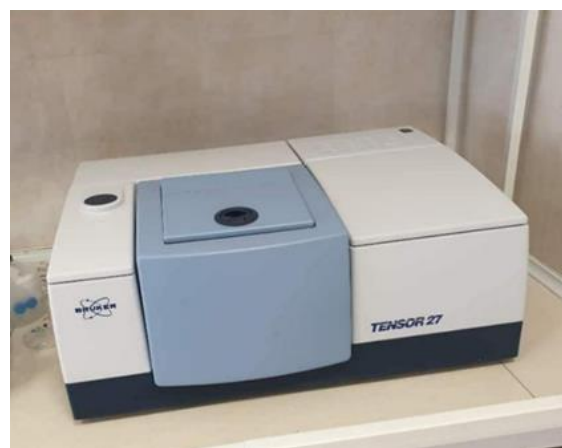
Figure 2: ATR-FTIS device.

A 4100 ATR-FTIS device. (Bruker, Tensor 27, Germany) Fourier transform infrared spectrophotometer (FTIR) with a diamond attenuated total reflectance (ATR) accessory was used to obtain infrared spectra for analysis of dentin specimens, as shown in Figure 2. First, two spots on the specimens' pulpal surface were randomly chosen, then they were placed on a standard FTIR sample holder with a 3-mm diameter opening; after that, the spectra were measured.